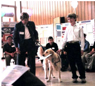
Izzy loves getting checks