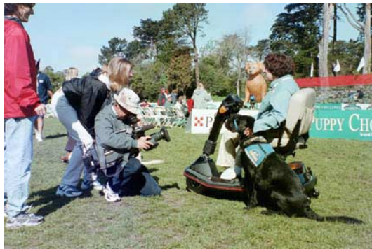
Each was interviewed twice