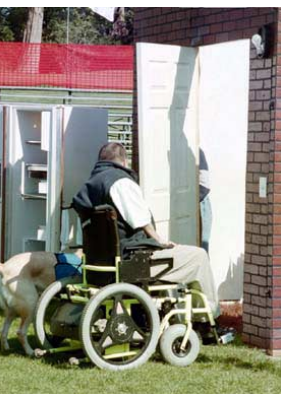
Truman opening door