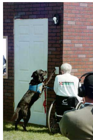
Union turning light on