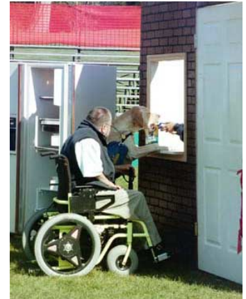
Truman making purchase