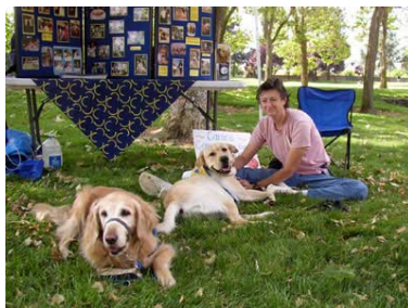
This officer learned about CCI by watching Avi & Rio .