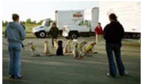
Good Stay Puppies!