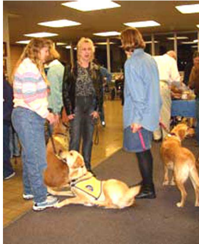
Family reunion: BC Joyce & Faith w/PR Cheri & Jagger and BC Jenny & Takia (both Faith's pups)