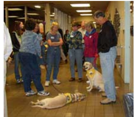
Is Haidis still breathing?