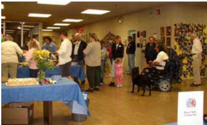
CCI people aren't shy with each other