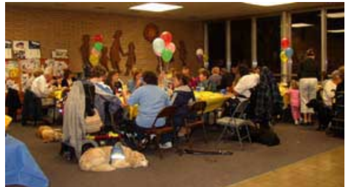
The food and company were great