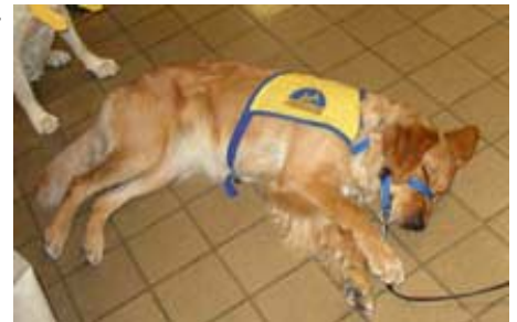
Letice really is alive