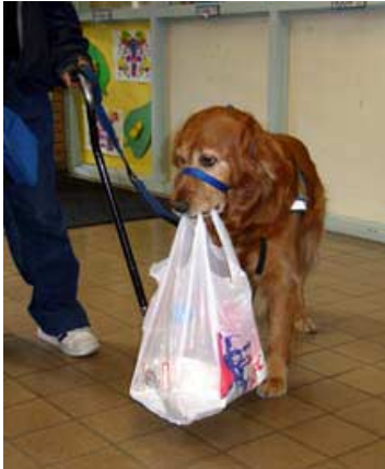
Winger - "This aroma is torture."