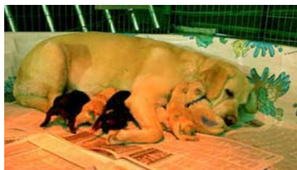
Kauai Looks Pooped!